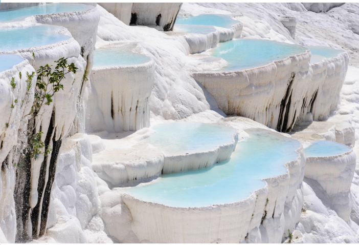
PAMUKKALE THERMAL POOLS OF